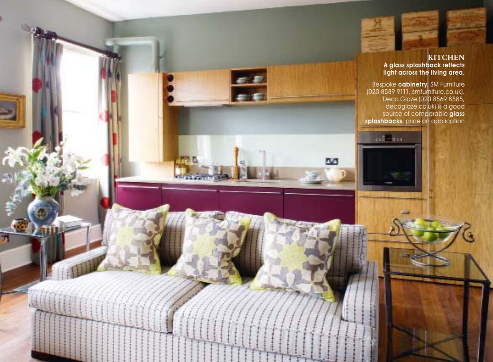
KITCHEN A glass splashback reflects light across the living area. Bespoke cabinetry, SM Furniture (020 8589 9111, smfurniture.co.uk), Deco Glaze (020 8569 8585, decoglaze.co.uk) is a good source of comparable glass splashbacks, price on application