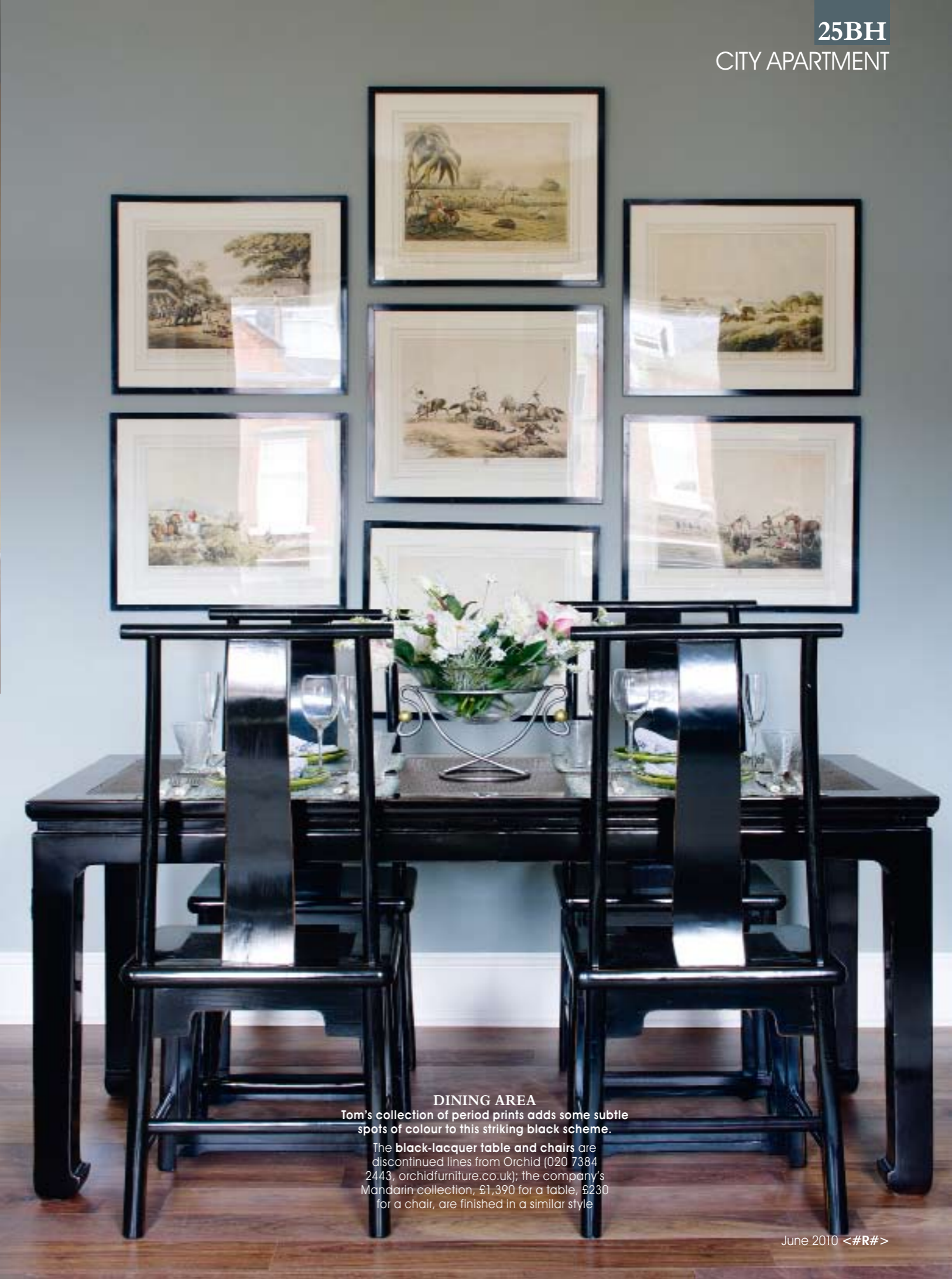
DINING AREA Tom's collection of period prints adds some subtle spots of colour to this striking black scheme.

The black-lacquer table and chairs are discontinued lines from Orchid (020 7384 2443, orchidfurniture.co.uk); the company's Mandarin collection, £1,390 for a table, £230 for a chair, are finished in a similar style